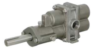
GH6, high pressure